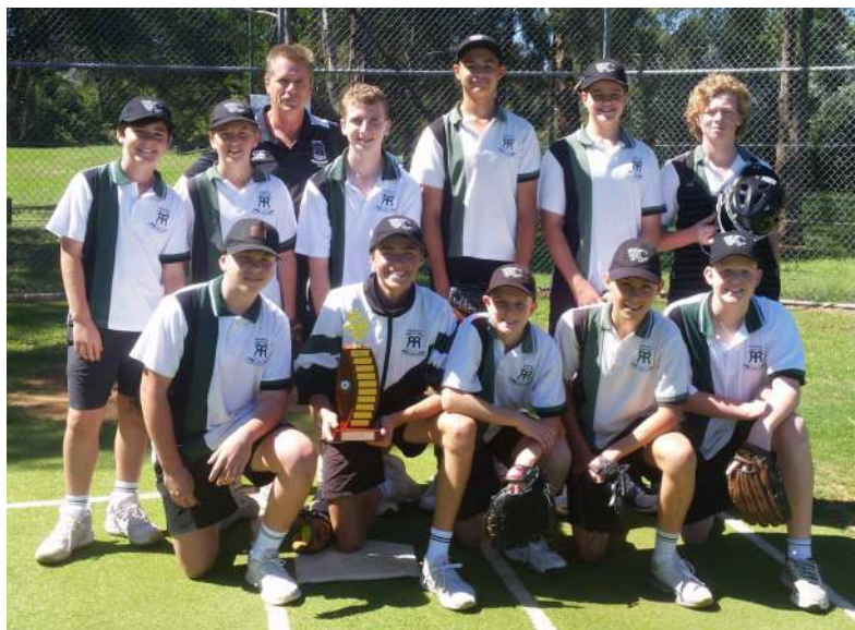
Photos of the MISA Champions - 7-9 Boys' Softball Side

Monday, 1 April NASSA Netball Gala Day Thursday, 4 April NASSA Football Trials Friday, 12 April WAC Cross Country